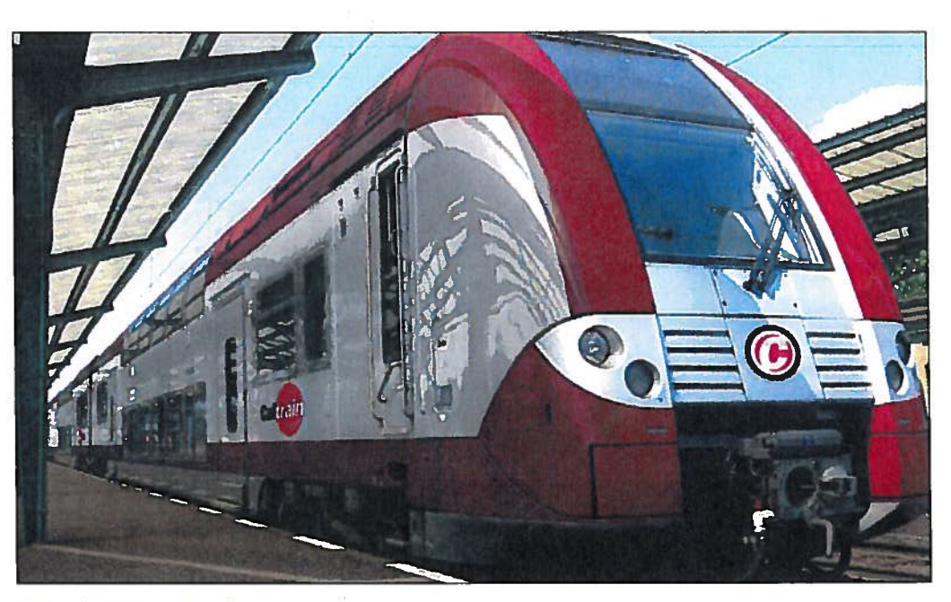
Caltrain EMU Vehicle