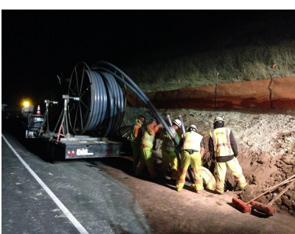
Top: Demolition of the median barriers to prepare for the installation of toll sign foundations. Bottom: Installation of conduit for the electrical system.