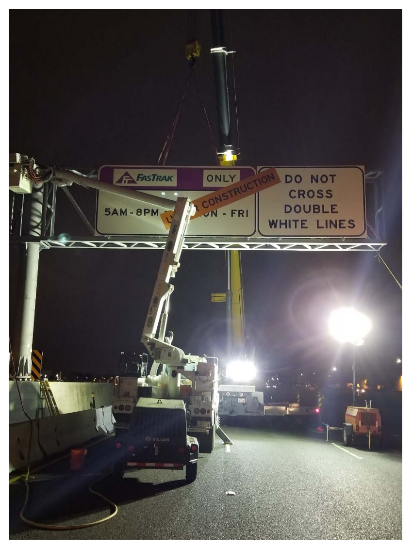
Crews install overhead signs on sign gantry.