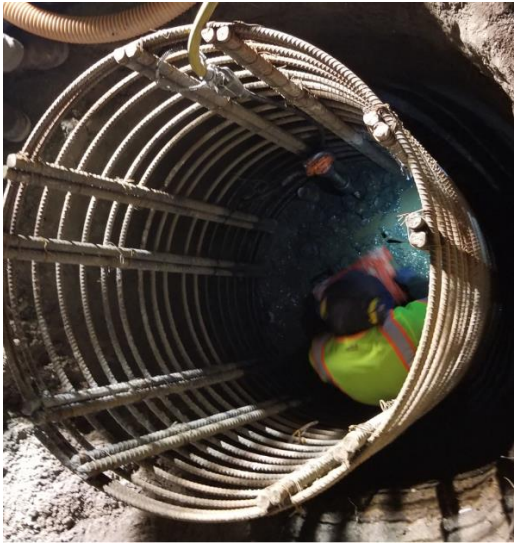
Preparing the top of the pile for sign-bridge pedestal.