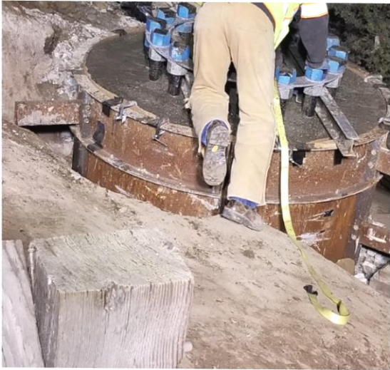
Finishing concrete on sign-bridge pedestal

If you would like to add people to our email list, or if you experience significant impacts or have questions, please contact us.