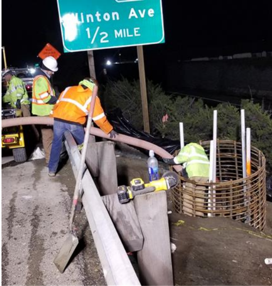
Placing concrete for CIDH pile