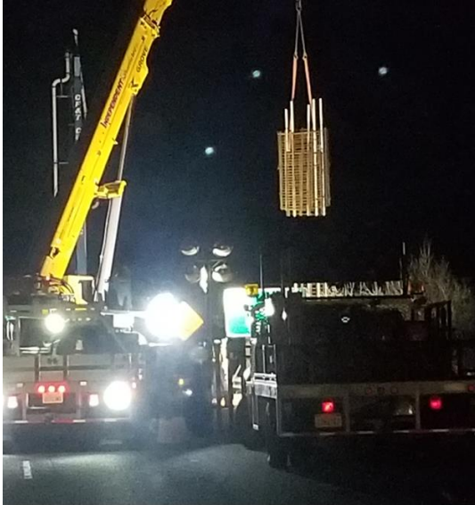
Setting reinforced steel cage for CIDH pile