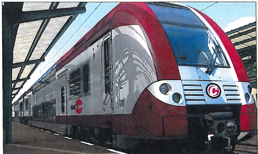
Caltrain EMU Vehicle

** Update/recirculation of the Caltrain Electrification project EA/FEIR.