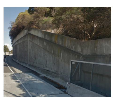
Eastbound I-580 requires widening in Contra Costa County to accommodate the third eastbound lane. The retaining wall shown must be removed and replaced with a wall set further back from I-580.