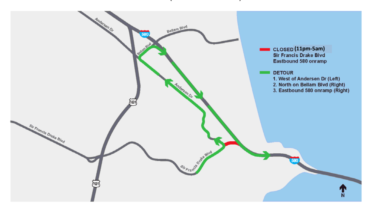
Detour Map 2 MARIN DETOUR: MAIN ST EASTBOUND 580 ON-RAMP

I-580 RICHMOND/SAN RAFAEL BRIDGE DETOUR MAP (EASTBOUND ONRAMP)