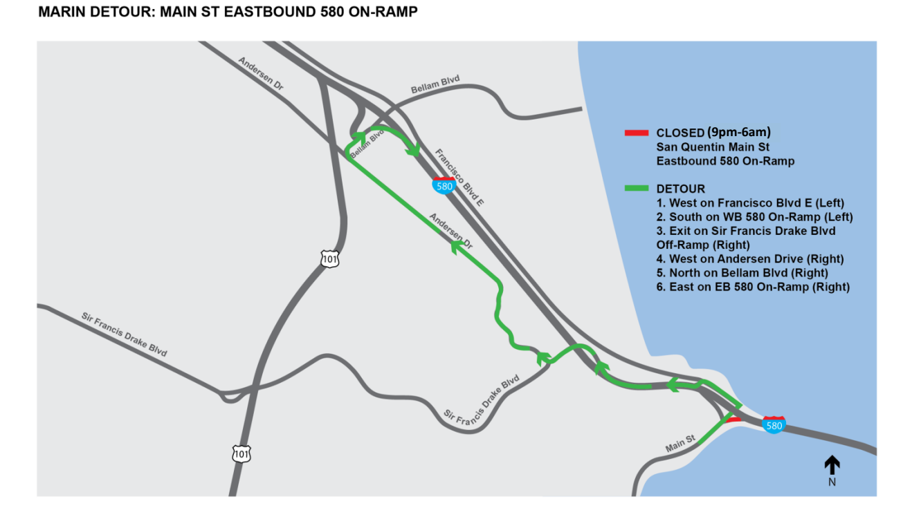
I-580 RICHMOND/SAN RAFAEL BRIDGE DETOUR MAP (EASTBOUND ONRAMP)