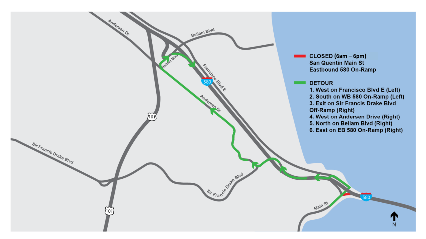
Detour Map 2 MARIN DETOUR: MAIN ST EASTBOUND 580 OFF-RAMP