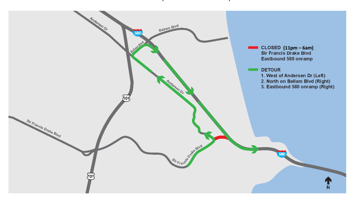
Detour Map 2 MARIN DETOUR: MAIN ST EASTBOUND 580 ON-RAMP