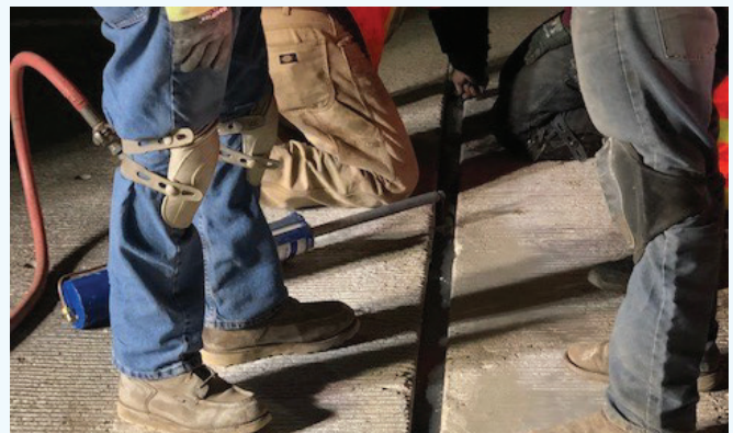
Crews finishing a new joint with a rubberized seal on the upper deck of the RSR Bridge.