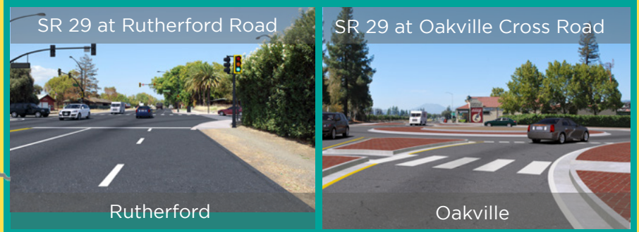
Renderings of Project Options