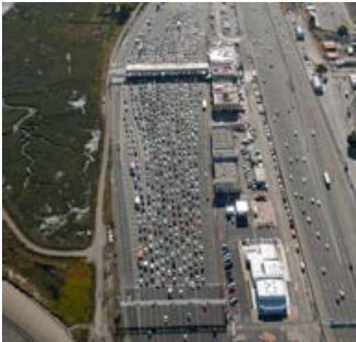
The heart of the Bay Area’s economic engine, the Bay Bridge accounts for over 40 percent of all transbay vehicle trips.