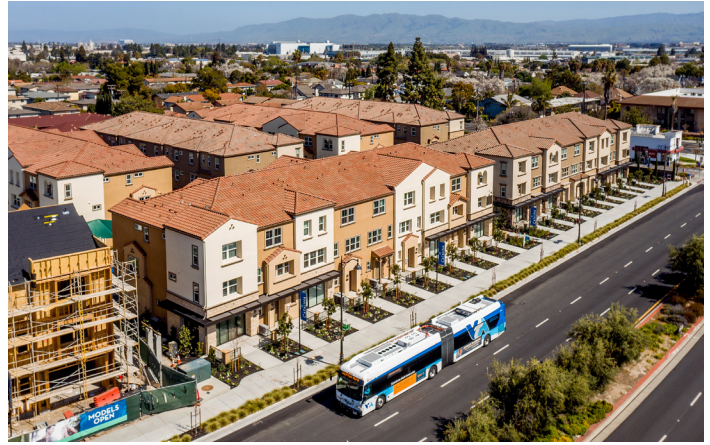
An affordable townhouse complex, newly completed in San José. Next door is a similar complex still under construction.