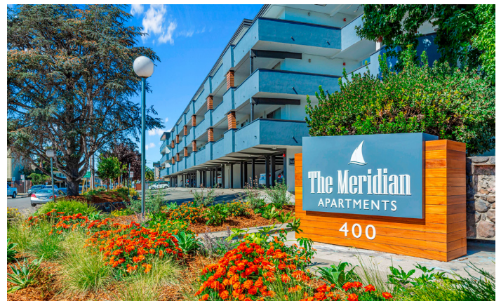
The Meridian Apartments, an affordable housing complex in San Rafael.