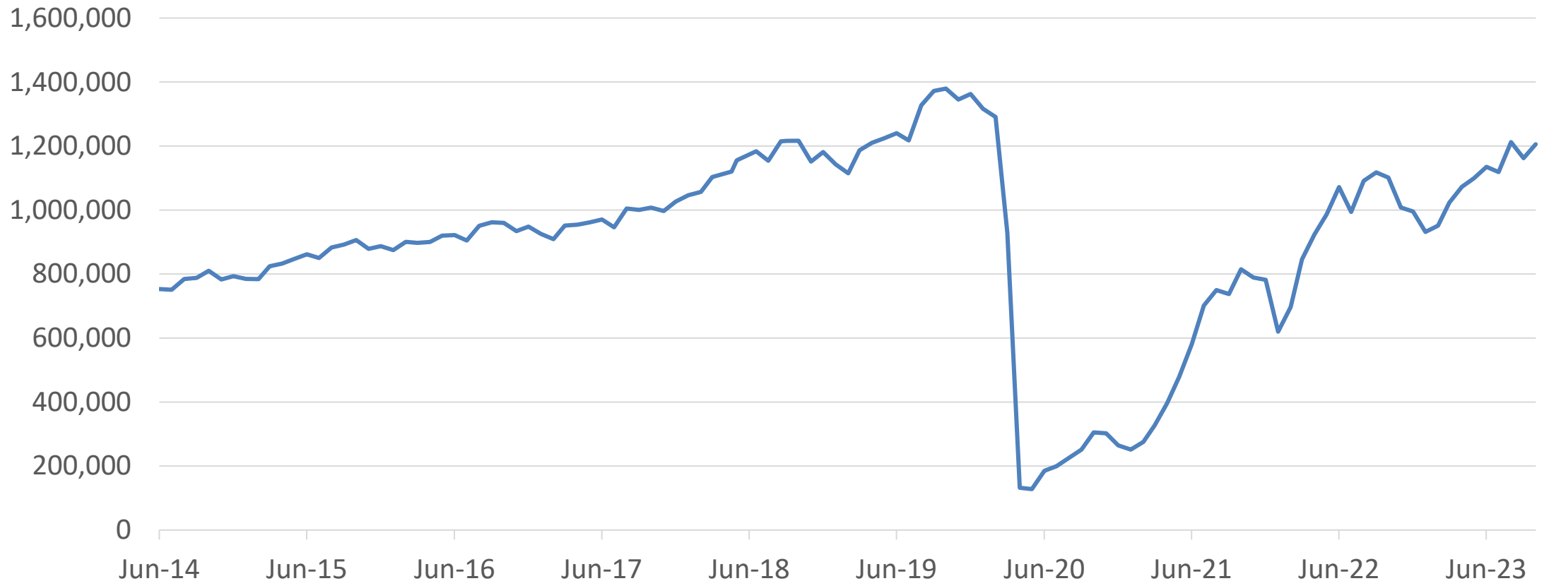
Unique Clipper Cards Used

Despite pandemic declines, in Oct 2023, unique Clipper cards used monthly has grown 35% since the formation of CEB