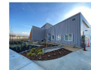
Photos of projects completed with RM 3 Capital Funding. Left – Mokelumne Trail Bicycle/Pedestrian Overcrossing of SR-4. Right – Vine Transit Maintenance Facility.