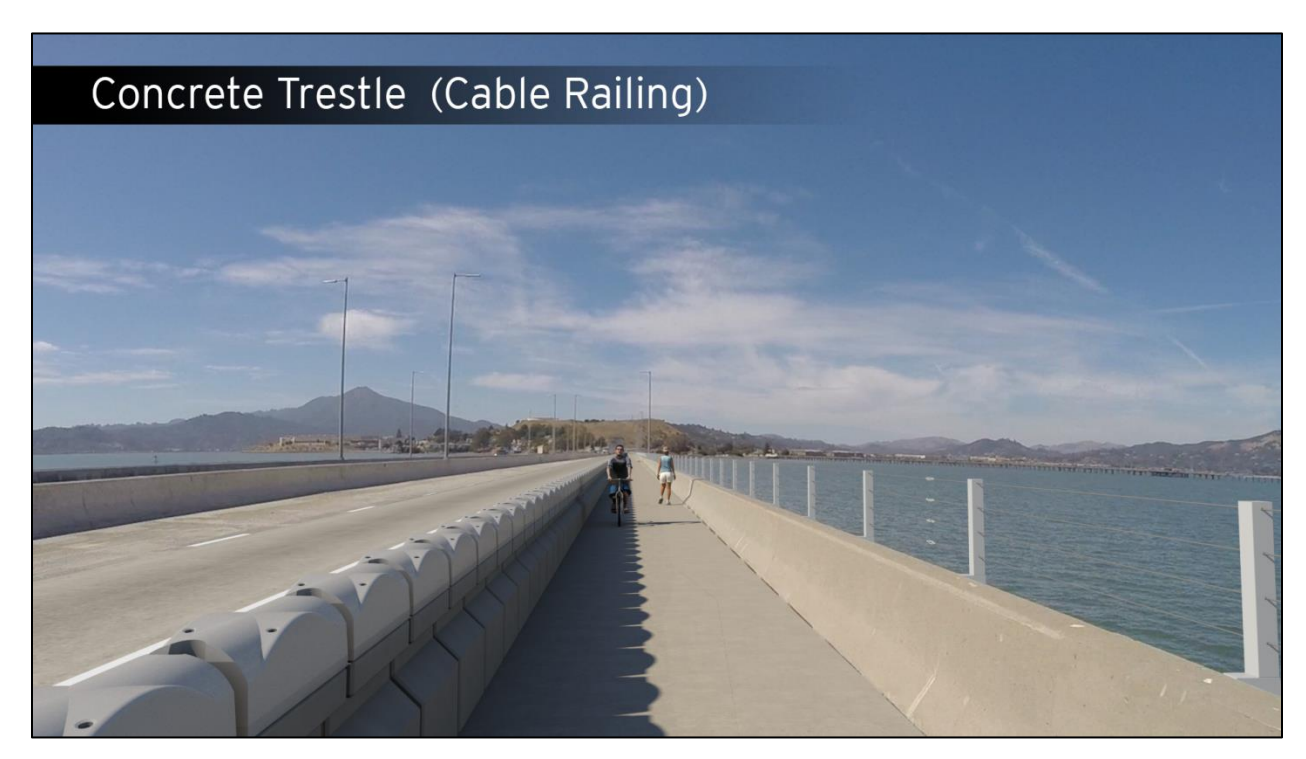
Figure 1: Richmond-San Rafael Bridge Concrete Trestle section, facing west.