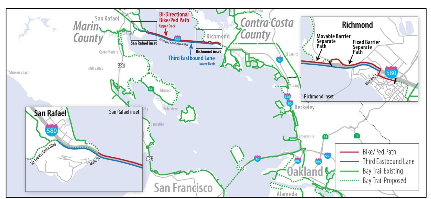
Figure 4: Project Area Map