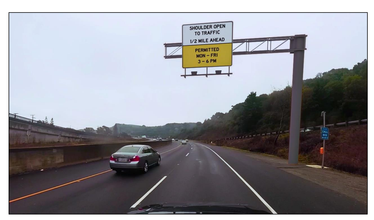
Figure 2: Eastbound I-580 in Contra Costa County, facing west.