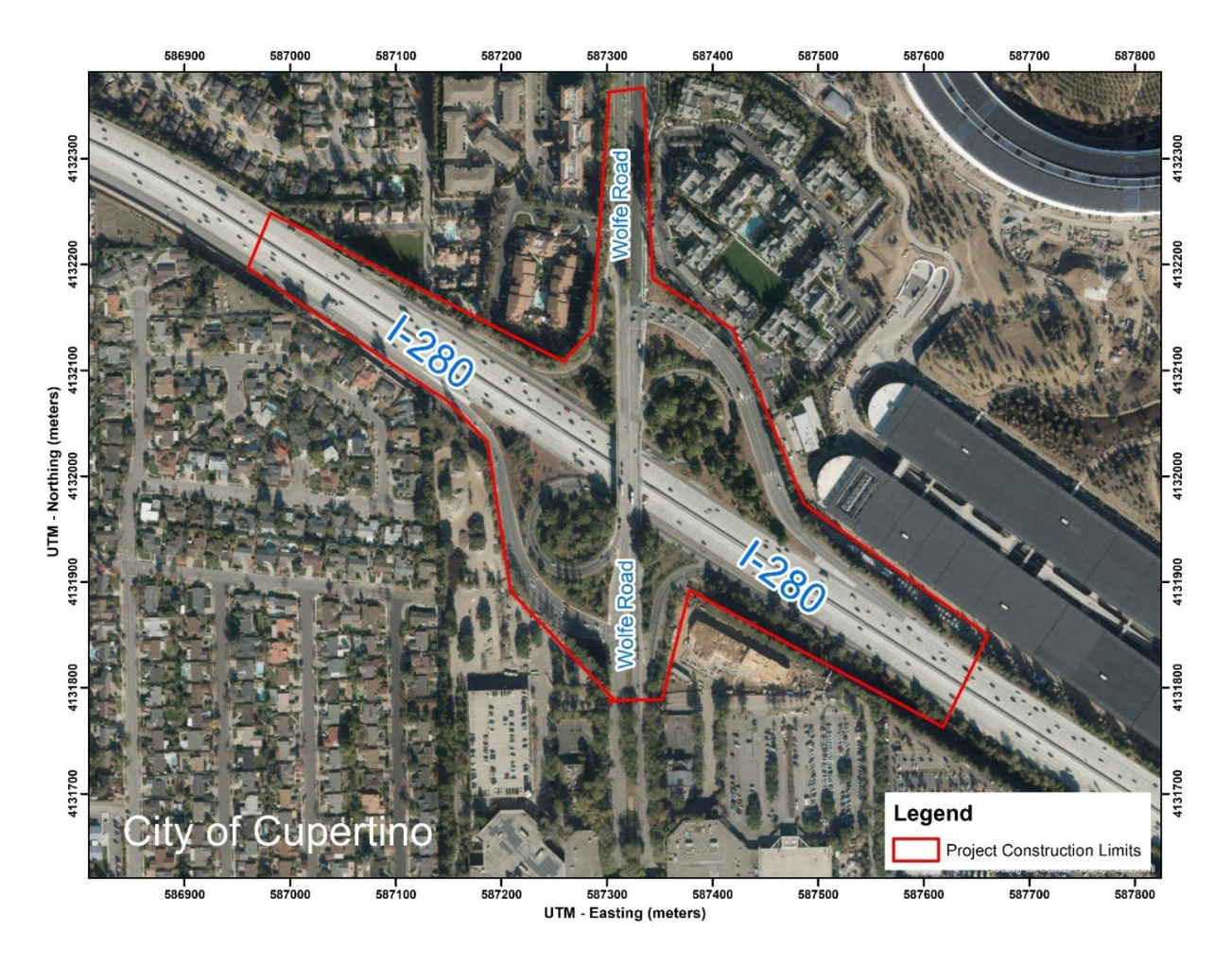
Figure 1 – Map of Project Limits and Surrounding Area